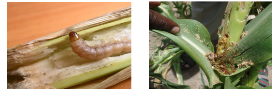
Using the push-pull system for planting stops the damage caused by stemborers (left), fall armyworm (middle) and striga weed (right)