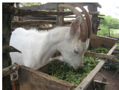
A dairy goat feeding on fodder from Push-Pull companion plants.

Following are success stories of Push-Pull farmers from Eastern Africa.