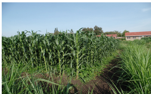
A Conventional Push-Pull field with silverleaf desmodium and Napier grass (upper left), Climate-Smart Push-Pull field with greenleaf desmodium and brachiaria grass (down left).