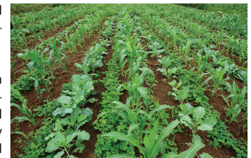
A Push-pull field integrated with vegetable crop (Kale)

5. Push-pull system has now been successfully integrated with high value vegetables, resulting in reduced pest damage, enhanced technology adoption and improved household nutrition, incomes, and livelihoods (please see photo on right).