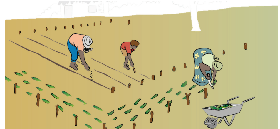
Drawings: Green Ink

1. Clear your land during the dry season and prepare the soil to make it very fine. Demarcate the push-pull plot to plant three rows of Napier or brachiaria grass around the border of the plot, as shown in this drawing.