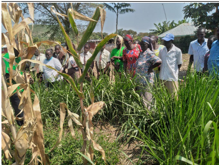
Figure 3: Farmers field day, Homabay County, Kenya