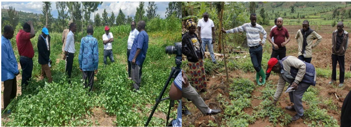
Figure 5: Rwanda Field days- MAC Members with PPT adopters in Gatsibo, Eastern Province (left). MAC members being shown the reserve area for Desmodium, which acts as source of planting materials (right).

In Uganda, NARO conducted four stakeholder workshops and meetings conducted on 18th Feb 2021, 9th February 2022, and 29th June 2022, 13th December 2022. Farmers, agro-processors, district production, marketers, transporters, agricultural technology generators, and the media. The district extension officers were directly involved in the regular promotional events.