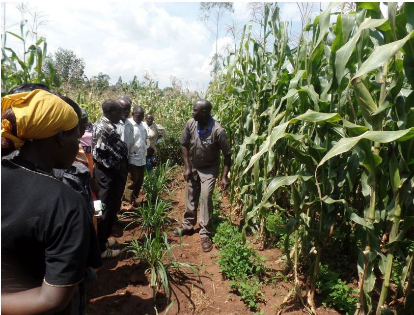
Figure 2: Farmer teacher training event in Western Kenya.

Farmers teachers are locally embedded experienced farmers, usually early adopters, who have the skills and passion to pass on knowledge to fellow farmers. They are different from ToTs, who are mainly agricultural field staff. The Farmers teachers have personal connection with their farm communities and understand the local contexts. The use of farmer teachers as extension agents was more interactive and facilitated co-learning and multidirectional information exchange. They contributed to strategies for overcoming barriers to utilization of information, understanding client information needs, and designing more appropriate information delivery approaches. Therefore, the farmer teacher training events are part of the strategy to not only deliver impactful training, but also as a measure of sustainability. The push-pull step-by-step manual and the Push-pull curriculum for farmer field schools were used as resource and reference material.